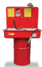
MODEL 16/30 Manual Sink

After more than 50 years, Safety-Kleen continues to lead the Parts Washing Industry by providing unrivaled service and top-notch equipment. With our extensive line of manual and automated equipment, our high performance solvent and aqueous chemistries and unmatched service, we can provide the customized equipment and program your needs demand.