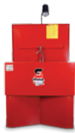
Aqueous Available MODEL 34/44 Manual Vat