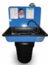
Aqueous MODEL 94/90 Manual Sink