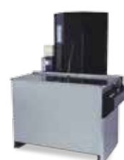
Aqueous MODEL 81.8 Heated, Immersion Agitation