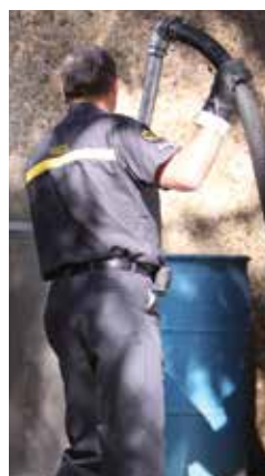
USED OIL/OIL FILTER COLLECTION