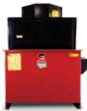
MODEL 81 Immersion Agitation