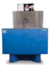
MODEL 44/91 Vat Parts Washer

After more than 50 years, Safety-Kleen continues to lead the Parts Washing industry by providing unrivaled service and top-notch equipment to help meet your performance demands. With our extensive line of manual and automated equipment, our high performance solvent and aqueous chemistries and superior service, we can provide the customized program your cleaning needs demand.