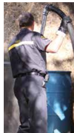
USED OIL/OIL FILTER COLLECTION