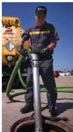
VACUUM TRUCK SERVICES