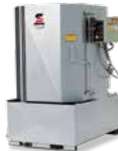
FL-500 Spray Washer