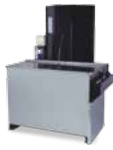
MODEL 81.8 Immersion Agitation