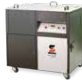
MODEL 6315 Immersion Ultrasonic