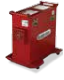
MODEL 275 Solvent Recycling for existing equipment